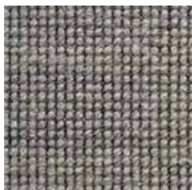
Golf Beige Grey 6951 Golf Tiles Beige Grey 695105