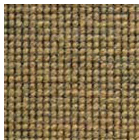
Golf Fudge 6953 Golf Tiles Fudge 695305