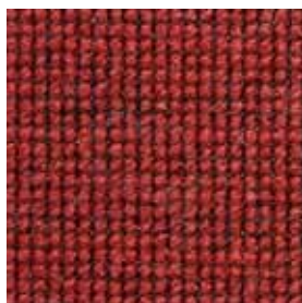
Golf Red 6927 Golf Tiles Red 692705