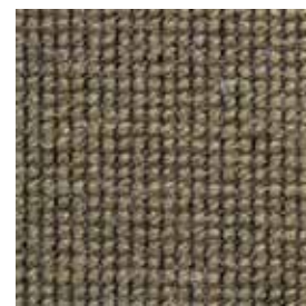
Golf Chocolate 6954 Golf Tiles Chocolate 695405