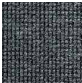
Golf Dark Grey 6915 Golf Tiles Dark Grey 691505