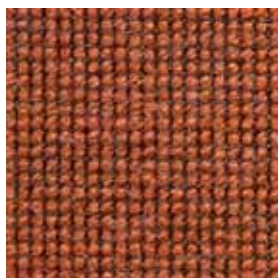
Golf Terracotta 6924 Golf Tiles Terracotta 692405