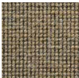
Golf Nougat 6952 Golf Tiles Nougat 695205