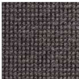
Golf Cool Grey 6913 Golf Tiles Cool Grey 691305