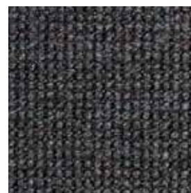
Golf Natural Black 6917 Golf Tiles Natural Black 691705