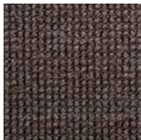
Golf Raisin 6957 Golf Tiles Raisin 695705

Showrooms in MILAN • NEW YORK • STOCKHOLM • GOTHENBURG