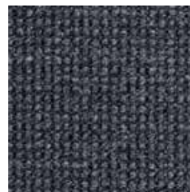
Golf Dark Marine 6948 Golf Tiles Dark Marine 694805