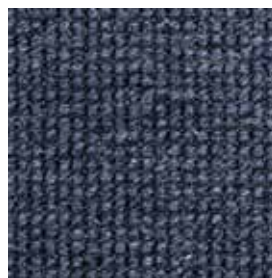
Golf Navy 6945 Golf Tiles Navy 694505