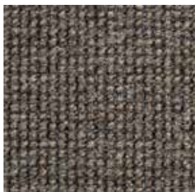
Golf Grey Brown 6956 Golf Tiles Grey Brown 695605