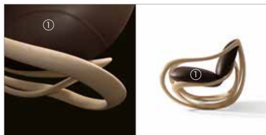
1 Move 69810 leather 9122 fin.96