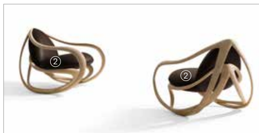
1 Move 69810 leather 9122 fin.96