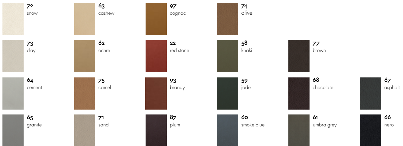
Seat shell Leather