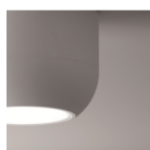
BC Wrinkled white