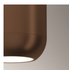
BR Matt bronze