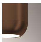
BR Matt bronze