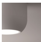
BC Wrinkled white