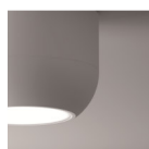
BC Wrinkled white