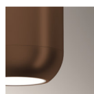
BR Matt bronze