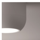
BC Wrinkled white