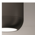
NI Matt nickel

EELc (Energy Efficiency Label compatibility) contain built in LED lamps that cannot be changed: A, A+, A++