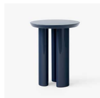
→ Steel Blue