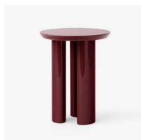
→ Burgundy Red