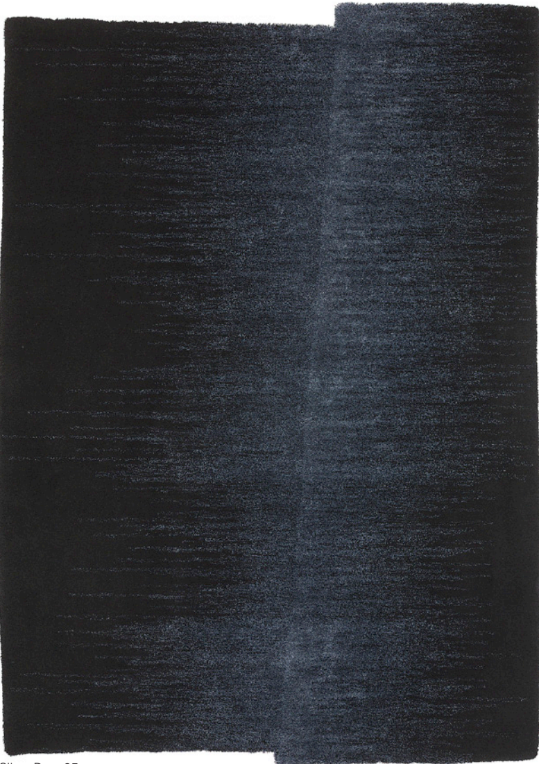
Silver Dust 25