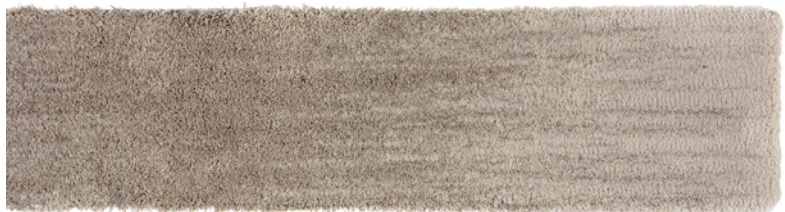
Shimmering Sand 88