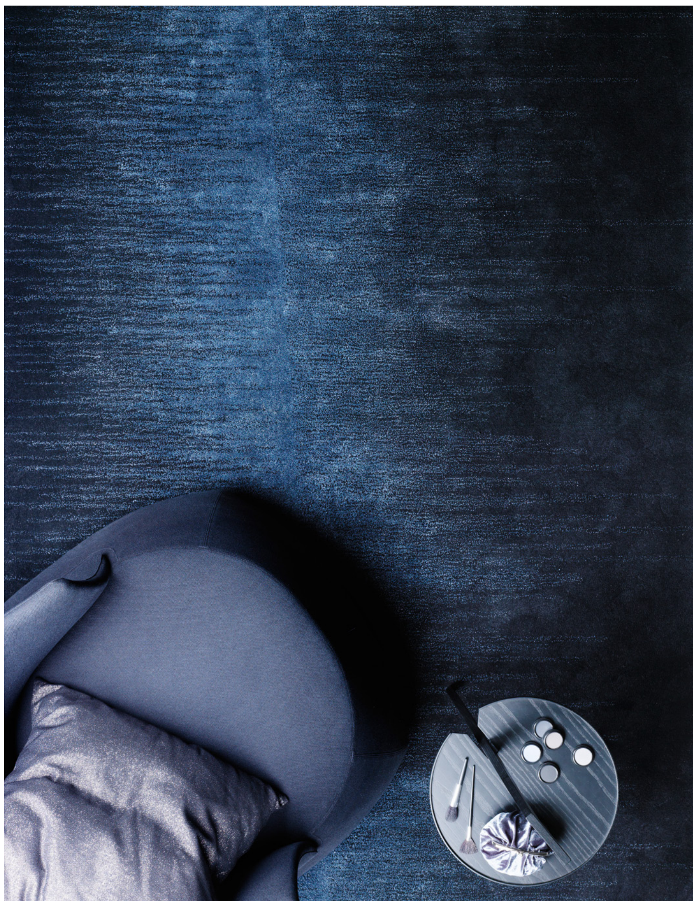
Glimmer – Silver Dust 25