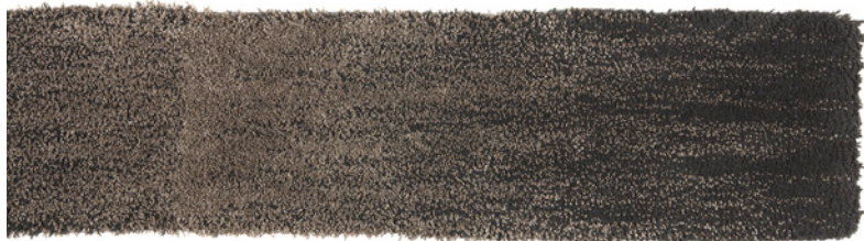
Velvet Truffle 77