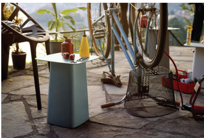
Metal Side Table (Outdoor)

In the powder-coated version with a fine textured finish, the Metal Side Tables serve as weatherproof occasional tables for balcony and garden. The tables make a perfect companion for the indoor-outdoor Waver armchair, which is available with bases in matching colours.