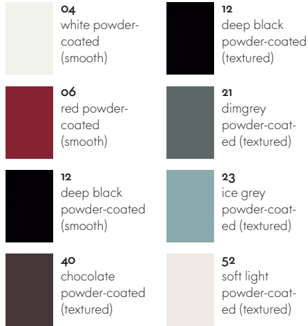
Sheet steel, high-gloss powder-coated