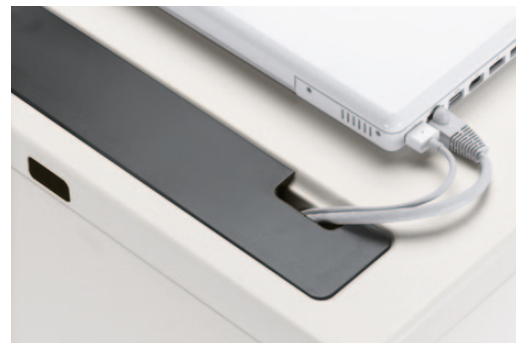
There are also a number of well thought-out electrification solutions inside (Media and Catering Caddy).