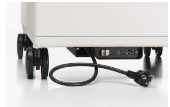
Patch panel for a whole range of purposes (Media Caddy) and the power cable retraction function (Media and Catering Caddy) make it easier to work with Caddy.