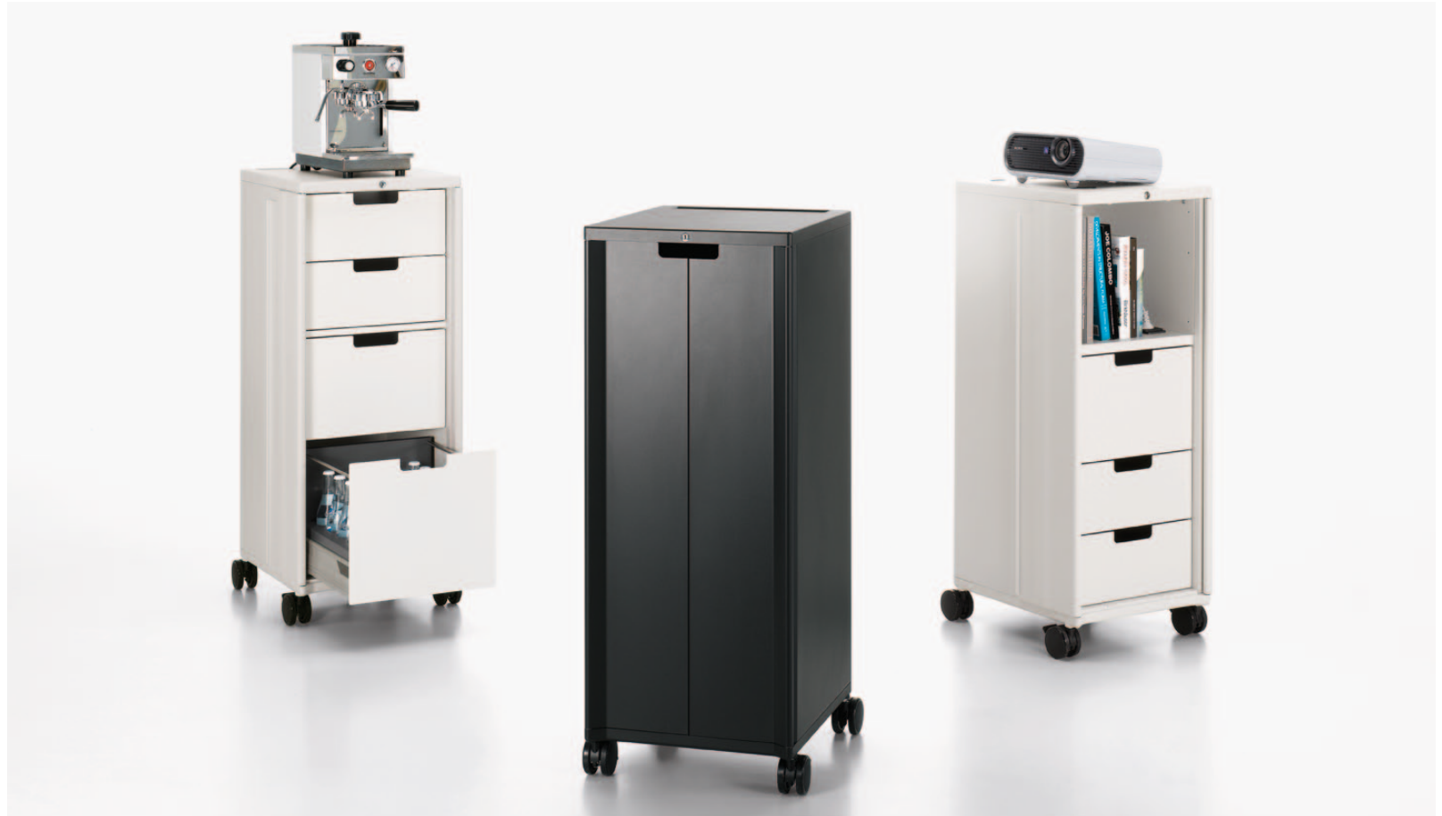
Thanks to its discreet design, Caddy can be easily integrated into a whole range of environments. The four models, Caddy 1, Caddy 2, Media Caddy and Catering Caddy, can also be customised again at a later stage.

Aircraft trolleys were the source of inspiration for Christoph Ingenhoven when designing Caddy, a piece of mobile storage furniture offering the following benefits: It's flexible, robust, practical and durable. Its discreet appearance reveals countless options when it comes to internal design. The basic configurations, Caddy 1, Caddy 2, Media Caddy and Catering Caddy, cover a whole range of needs, making Caddy a flexible piece of storage furniture that takes up very little space. It also has electrical connection points meaning that it can be used as a mobile stand-up workstation, for conferences and presentations requiring beamers, or customised for specific catering needs.