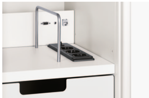
Practical and within easy reach: Caddy's electrification solutions (Media Caddy).

Caddy offers storage space to cover daily office needs, can serve as a mobile laptop workstation thanks to its electrical connection options, which also mean that a data projector, coffee machine or other similar item of electrical equipment can be used.