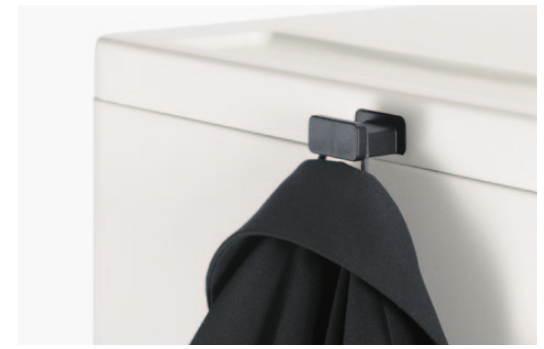
Practical point: The extendable coat hook.