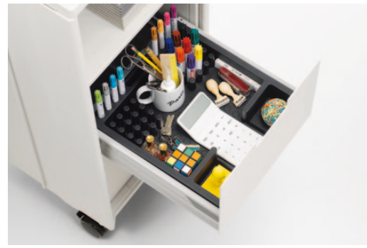
Utensils can be easily organised thanks to the utensil drawer made of integral foam.