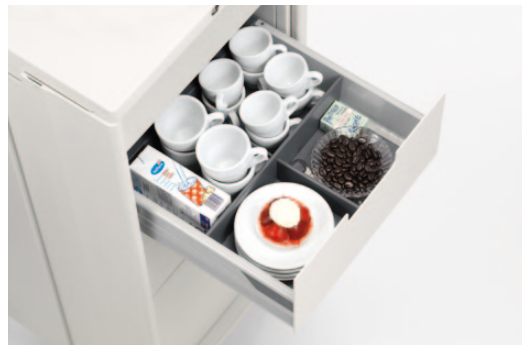
Solutions for various applications: Caddy is also suitable for catering purposes.

Caddy has a number of functional details including a clever magnetic door mechanism, a utensil drawer made of integral foam, an extendable coat hook, or flexible sheet steel dividers to subdivide the drawers, which have a soft closing action.