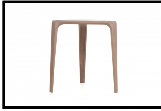
385 MARYS SIDE TABLE