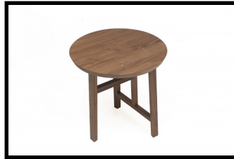
754S TRIO SIDE TABLE