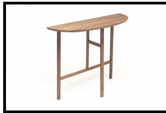
754C TRIO CONSOLE TABLE