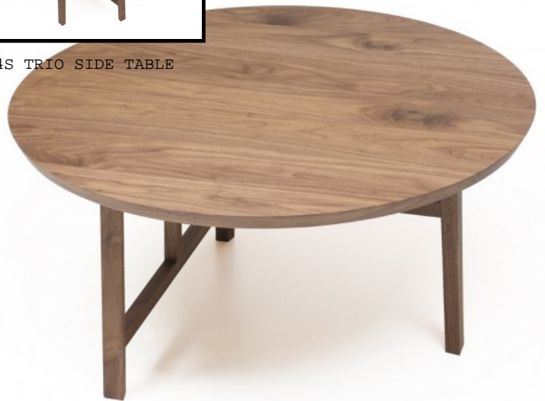
754M Trio Round Coffee Table