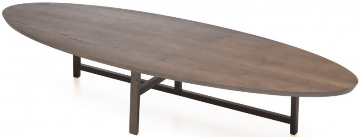
7540 Trio Oval Coffee Table